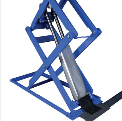
Master-slave including protective cover

All Falco car bridges comply with the NEN-EN1493 safety standard and are supplied with a Dutch manual including maintenance protocol and CE certificate 2006/42/EG.