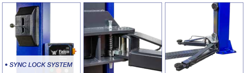
• SYNC LOCK SYSTEM